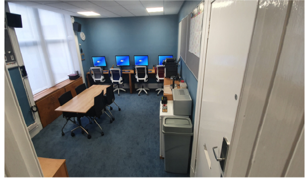
The HBS Production Office before and after major refurbishment work carried out at the start of 2020

With the restrictions imposed during the year, many of the planned developments had to be put on-hold. These included increasing volunteer numbers and a focus on developing the skills of the whole team to deliver improvements to the service. As restrictions ease through 2021 we hope to pick up on these initiatives.