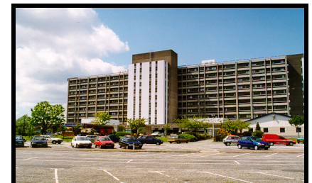
Gartnavel General Hospital