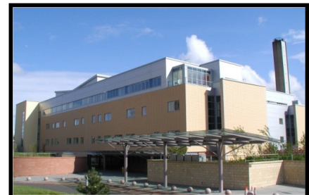
Beatson Oncology Centre