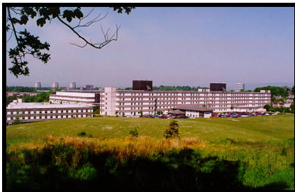
Royal Alexandra Hospital