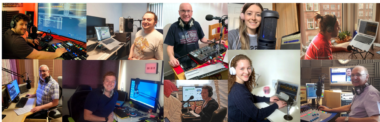
Some of the volunteer's home studio setups which allow HBS to continue providing programmes despite lockdown restrictions

It wasn't just the Open Line request shows that were broadcast live remotely. With the volunteer team being mainly 'confined to quarters' and with time on their hands, additional live programmes were added to the broadcast schedule resulting in the early summer months of more live shows than had been the case pre-covid.