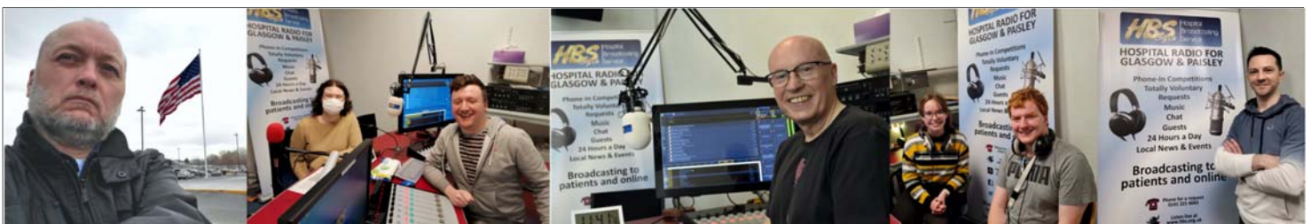
Through the year many of the team returned to broadcasting from the central studios in Baltic Chambers, plus we also added a new show from a former volunteer who re-joined with programmes from his home in America.

The initial temperature-control solution was going to be based on air-conditioning equipment however a review of both Covid mitigation and equipment running costs identified that a significantly increased flow of fresh air would be a more appropriate solution. The majority of this work was completed during the year with final completion works rolling-over to 2022.