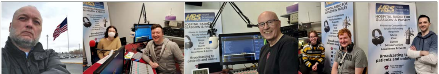
Through the year many of the team returned to broadcasting from the central studios in Baltic Chambers, plus we also added a new show from a former volunteer who re-joined with programmes from his home in America.

The initial temperature-control solution was going to be based on air-conditioning equipment however a review of both Covid mitigation and equipment running costs identified that a significantly increased flow of fresh air would be a more appropriate solution. The majority of this work was completed during the year with final completion works rolling-over to 2022.